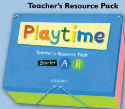
Teacher's Resource Pack