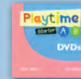
DVD • All stories animated