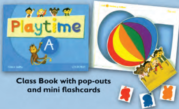
Class Book with pop-outs and mini flashcards