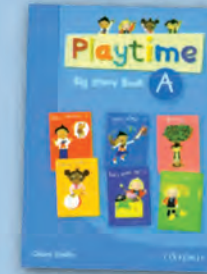
Big Story Book