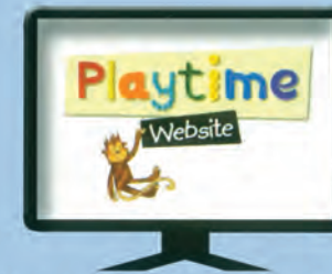
Parent and teacher website: • Songs • Games • Photocopiable resources